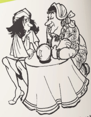
“Who cares about the future — where the hell was I last night?” — A Rabbit Walks Into a Bar